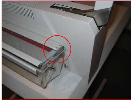
Clamp Removal--2 Screws at each end of clamp