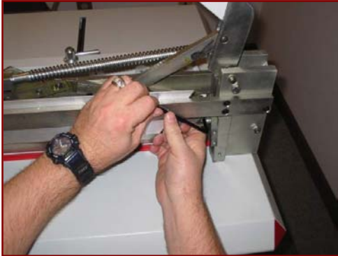
Photo 1-Blade handle must be properly positioned to get access to the outer Allen screws.

instructions are needed please contact Martin Yale Industries, Inc. at 800-225-5644, or info@martinyale.com .