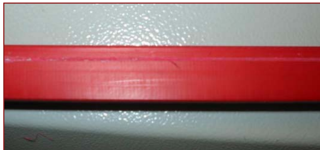
A severe groove in cutting stick can keep even a sharp blade from going all the way through the stack