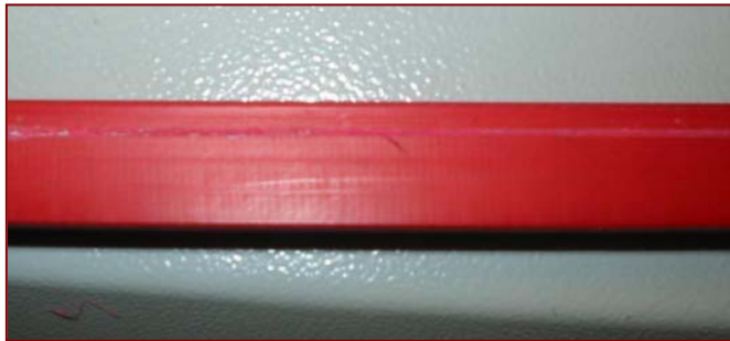
A severe groove in cutting stick can keep even a sharp blade from going all the way through the stack