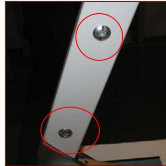
Step 1--Handle Rear