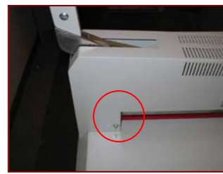
Shroud Screw—Blade Side, Another on opposite side!