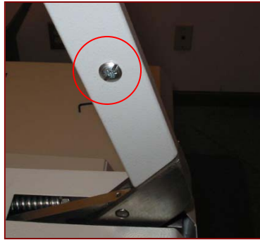
Step 1--Handle Front