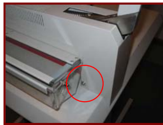
Shroud Screw--Clamp Side