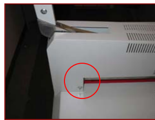
Shroud Screw—Blade Side, Another on opposite side!