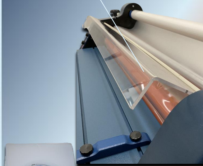
Sensored Safety Shield

The new generation of TCC-EASY series, EASY-2, it now available at HOP Industries! It is more energy-efficient, easier to use and maintain & the most important feature – it is safer with UL certification. The EASY-2 is designed in the USA and produced in Taiwan pushing the industry standard to a higher level. In addition, we offer you a free 1-year warranty along with your purchase.