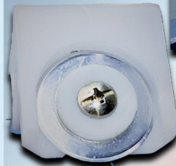
Shear Knife Design