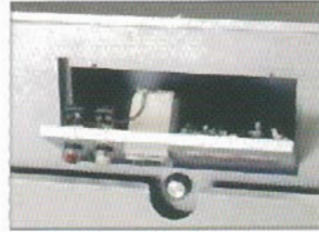
Tunnel Control Panel Lowers for Easy Access