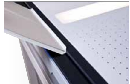
Edge folding unit.