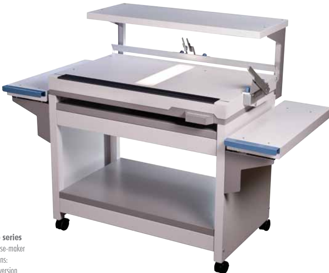
CASEMATIC a46 series Semi automated case-maker Two different versions: • a46z table top version • a46a stand alone version