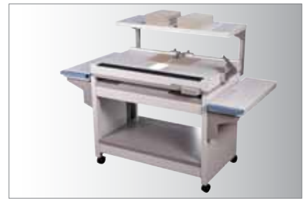
Casematic a46a : Stand-alone version