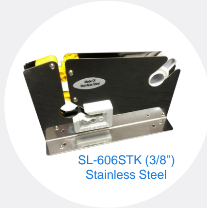
SL-606STK (3/8") Stainless Steel