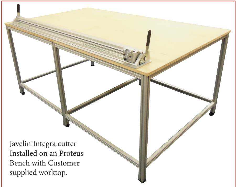
Javelin Integra cutter Installed on an Proteus Bench with Customer supplied worktop.

Any bench or table unit can be fitted with a customer-supplied top of choice. Recommended to use ¾” thick MDF or finished plywood.