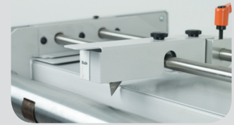
Retractable cutting blades