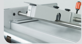
Retractable cutting blades