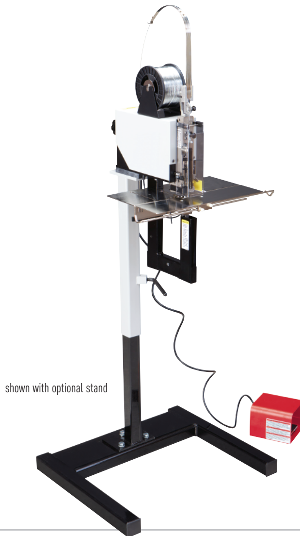
shown with optional stand

Dimensions (D x W x H): 15 x 16 x 24 inches, Shipping weight: 50 lbs.