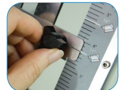
Clearly marked fold plates for quick and easy setup

The FD 314 Office Desktop Folder provides user-friendly controls in a rugged, compact unit. Clearly-marked fold settings and push-button operation make it easy to use, right out of the box. It's capable of folding 11" and 14" paper at speeds up to 7,700 sheets per hour, with a hopper capacity of up to 250 sheets.