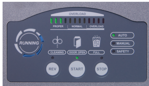
LED control panel with visual load indicator

The FD 8906CC offers unmatched automated features through its LED control panel. The easy-to-read Load Indicator assists operators in determining how close they are to the maximum shred capacity to avoid jams and provide optimal efficiency. Operators can select from two modes of operation: Auto Start/Stop or Manual. Auto Start/Stop mode utilizes optical sensors which detect paper and start/stop operation automatically. Manual mode provides non-stop operation for shredding small sized paper or films. The Safety Key Lock prevents unauthorized use of the shredder.