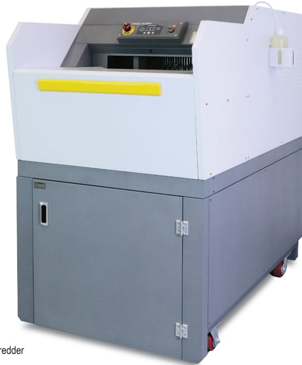
FD 8906CC Industrial Shredder