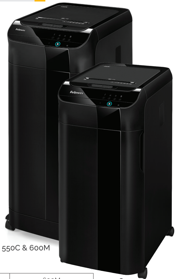
550C & 600M

Energy saving feature shuts down the shredder after 2 minutes of inactivity