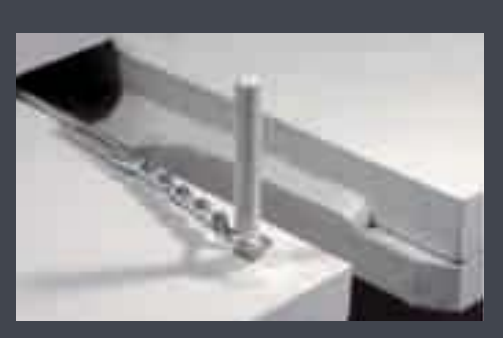
Wire or tape strapping

Safe locking-system Absolutely safe and easy-to-operate locking system – self-engaging.