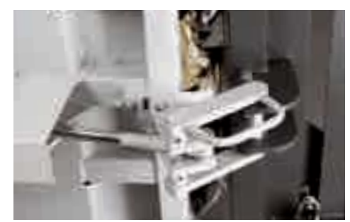
Sliding door with hydraulic door lock; additional covers optional for all three configurations.