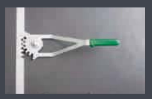
Self-engaging locking system

Safe locking-system Absolutely safe and easy-to-operate locking system – self-engaging.